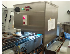
Full Package Verification