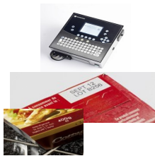
Automatic Printer Control

The various component modules shown below can be mixed and matched according to an individual products packing requirements.